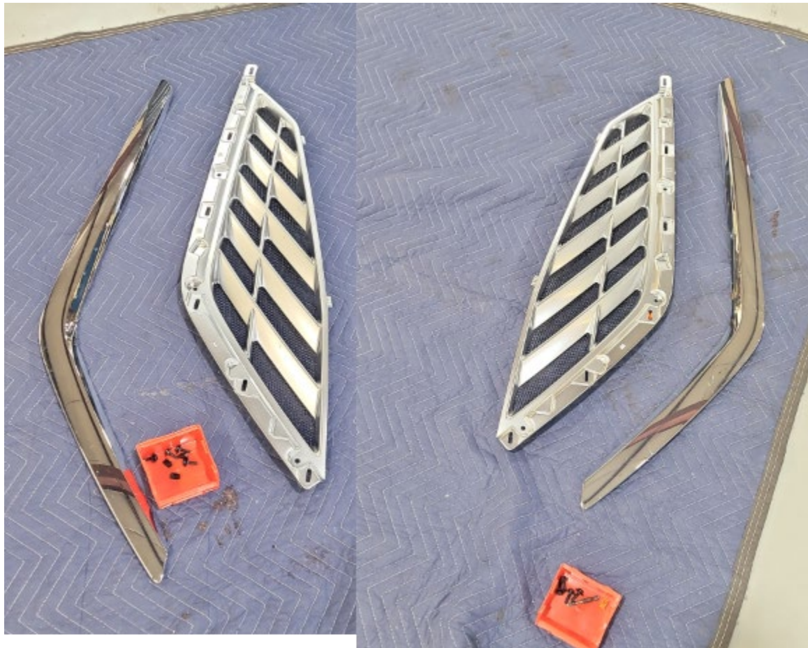
Photo of both left and right air vents + trim with screws and clips.